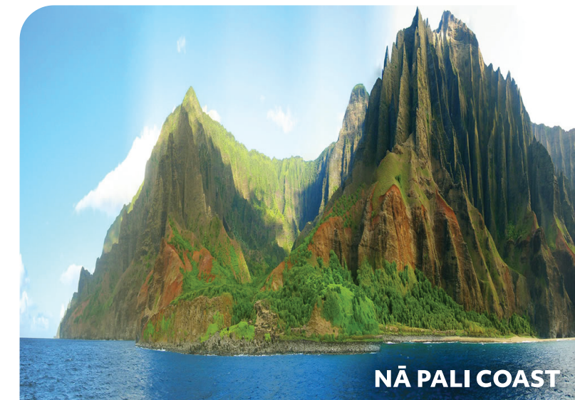
NĀ PALI COAST

Ride with us up the mountain to the 3,400-foot level and overlook Waimea Canyon, "The Grand Canyon of the Pacific." We promise a visual history along the way - Old Koloa Town, circa 1834, heart of Hawaii's first sugar cane plantation, and Waimea, the little town that grew up where Captain Cook first set foot in Hawaii in 1778. Follow the footsteps of Captain Cook along this memorable INCLUDED Kauai tour. The overlook at Opaekaa Falls is another stop that will surely secure your love of the Garden Island. Tour ends early afternoon and the ship remains docked in port overnight.